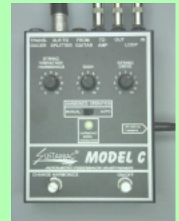
Sustainiamp floorbox amplifier/controller

The sensation of playing with a Sustainiac acoustic sustainer is indeed intense and exciting. Musicians often say that it feels like the instrument is actually alive in their hands. Yes, you definitely feel the vibrations! (The vibrations will not harm the instrument.) This sensation is like playing at extreme, deafening volume levels. Yet, the instrument amplifier volume can be turned all the way down to zero. The intensity and responsiveness are fully adjustable. In fact, the amount of feedback-sustain is so great that you can use it in ways you have never thought possible. You can take the instrument to a different level.