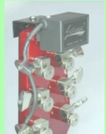
Sustainiac headstock-mounted transducer

The Sustainiac Model C sustainer is an electro-acoustic type sustainer. This is different from an electro-magnetic type sustainer. The Model C produces infinite sustain of an instrument's string vibrations by making intense acoustic feedback. It is like getting feedback from the loudspeakers of a very large, loud amp. Except much more so. Amp feedback is unpredictable . Sometimes it works, but often it doesn't. With the Model C , you get successful feedback-sustain at any volume level. It is very predictable and controllable. You can enhance solos or produce vibrational changes in the strings with success every time, because you are not relying on room acoustics and amp position as you are with amp feedback. The best part is that you don't have to play at high volume to get screaming feedback sustain. No more hearing loss from playing too loudly. Perfect for the studio or home.